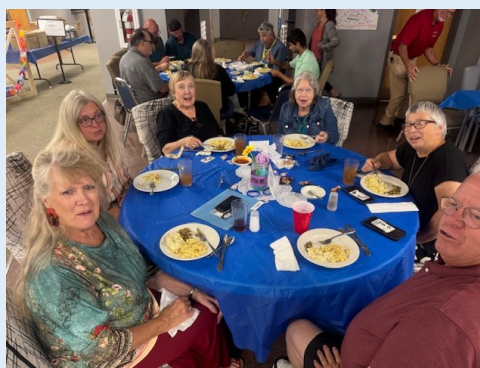
Dinner is Served!

Together, we can continue building God's kingdom — one testimony, one volunteer, and one weekend at a time!