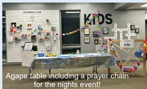
Agape table including a prayer chain for the nights event!