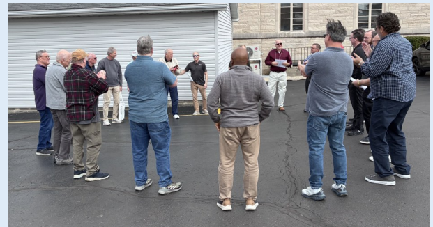
The volunteers of Kairos #29 at NCCF, sharing weekend experiences after the closing ceremony.