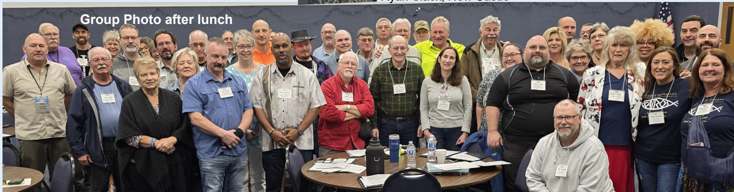
Group Photo after lunch