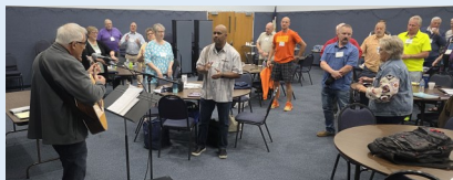
Opening Praise and worship time